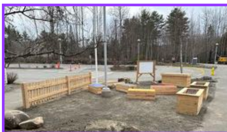
Flagpole area. Above: without students.

Over April Break, more work was done on our three new outdoor classroom spaces. A little more remains to be done but we will slowly begin using them and introducing our youngest grades to these areas.