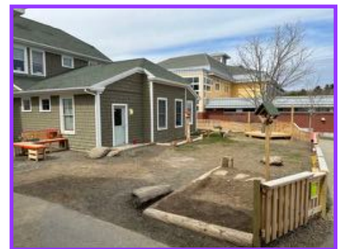
Kindergarten Outdoor Classroom