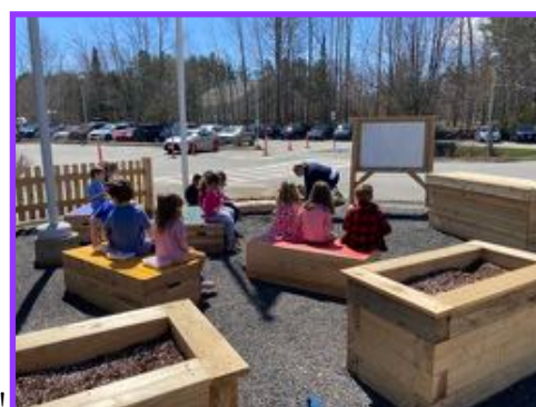
Right: with a class and students!